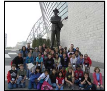
Lone Star Leadership Academy - Dallas/Fort Worth participants at Cowboys Stadium, Spring Break 2010.