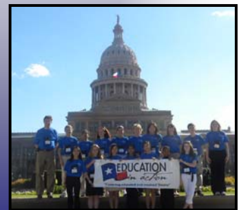
Lone Star Leadership Academy - Austin participants at the Texas State Capitol, Spring Break 2010.