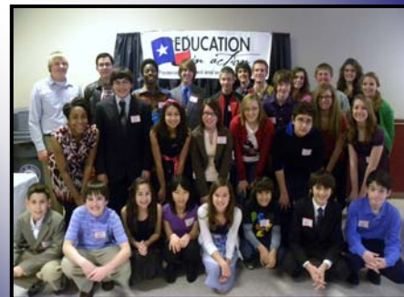
Lone Star Youth Leadership Council members at Education in Action's 8 th Annual Texas Independence Day Service Project Presentation and Recognition Ceremony, February 27, 2010.