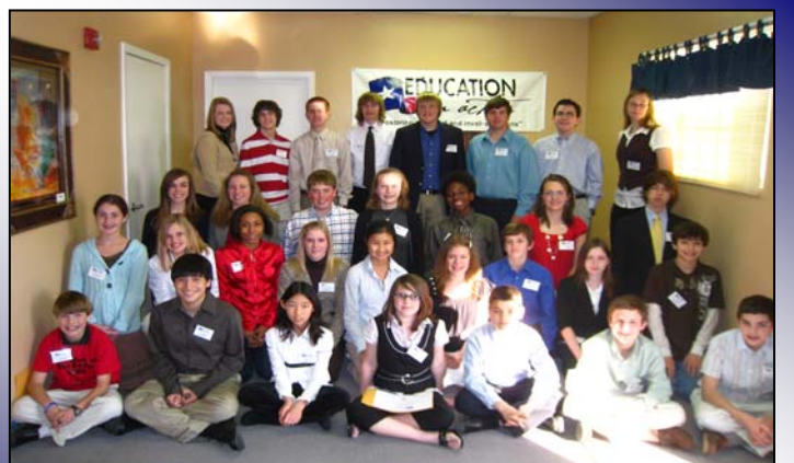
Lone Star Youth Leadership Council members that attended Education in Action's 7 th Annual Texas Independence Day Service Project Presentation and Recognition Ceremony, February 28, 2009.